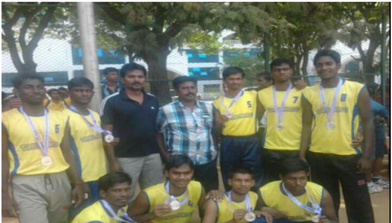
OUR TEAM SECURED SECOND PLACE IN 18 th NATIONAL GAMES OF THE DEAF