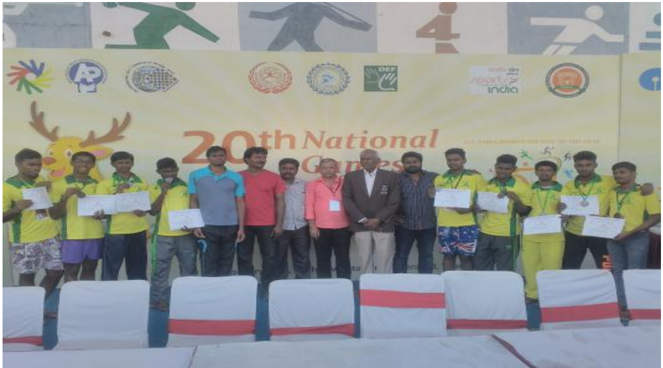
OUR TEAM SECURED THIRD PLACE IN 20 th NATIONAL GAMES OF THE DEAF